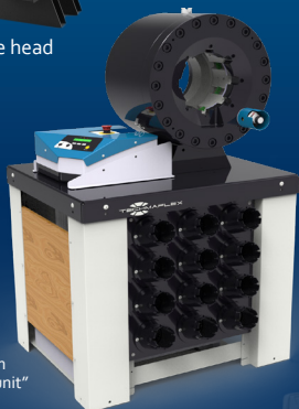
Production version with "silent" central unit