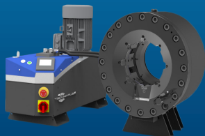
Version with remote head