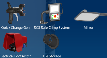
Quick Change Gun