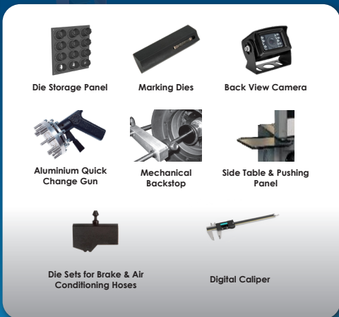
Die Storage Panel