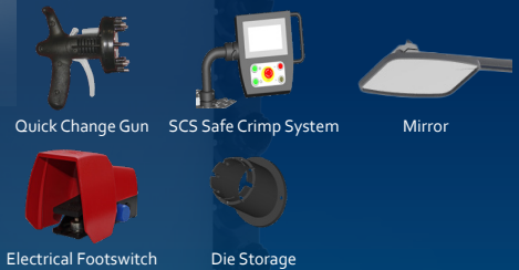
Quick Change Gun