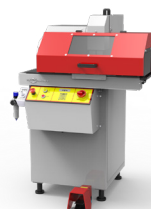
S CUT 75 P