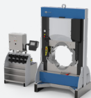
XL CRIMP 550-16