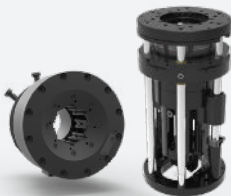
Autocrimp 108/158 Pro V