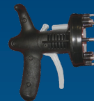
Quick Change Gun