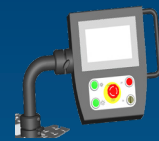
Tactile Screen 7"