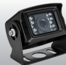
Back View Camera