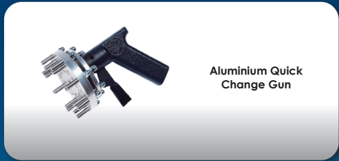
Aluminium Quick Change Gun